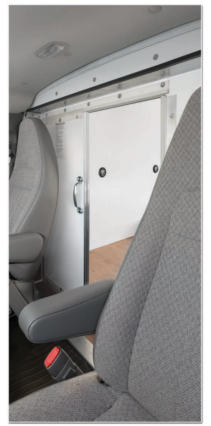
An option for a recessed bulkhead that provides more room in the cab and easier positioning of the seat.