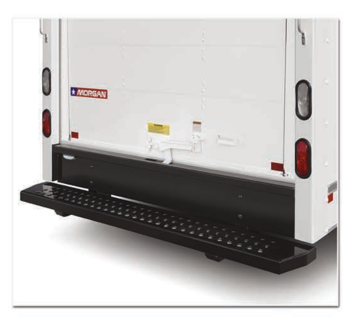
Easy Access Step Bumper