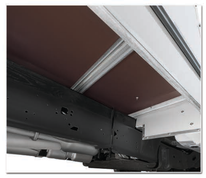
At Morgan, out-of-sight is NOT out-of-mind. Rest assured our subframe -- means your cargo and crew will be riding on the strongest, and best sub-frame in the business.