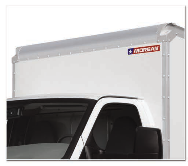
Morgan KNOWS that heavy use DEMANDS durability AND dependability! That's why we designed AND built the Mini-Mover to last. Starting with our front end radius corner design. – the Mini-Mover keeps your business moving!