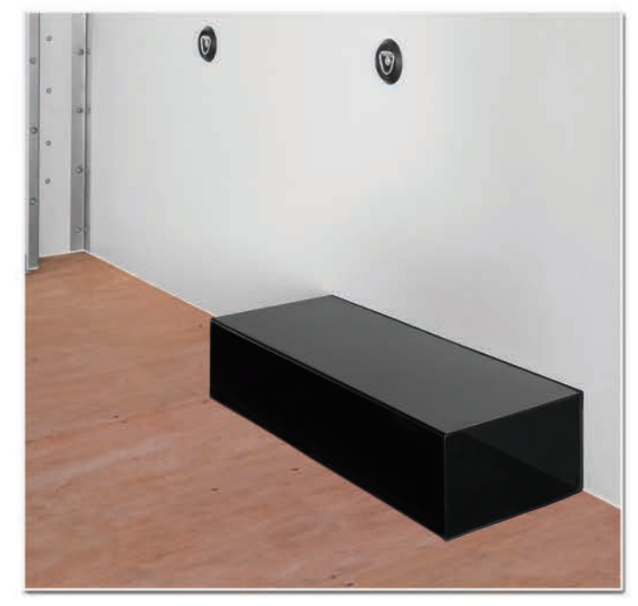
Frequent movement in and out of the cargo area is made easier and safer by Morgan's wheel box design and lowered-floor configuration. A lowered-floor means a lower step-up and less stress on delivery personnel. And the slip-resistant surface and strategically positioned grab handles also lend to greater safety.